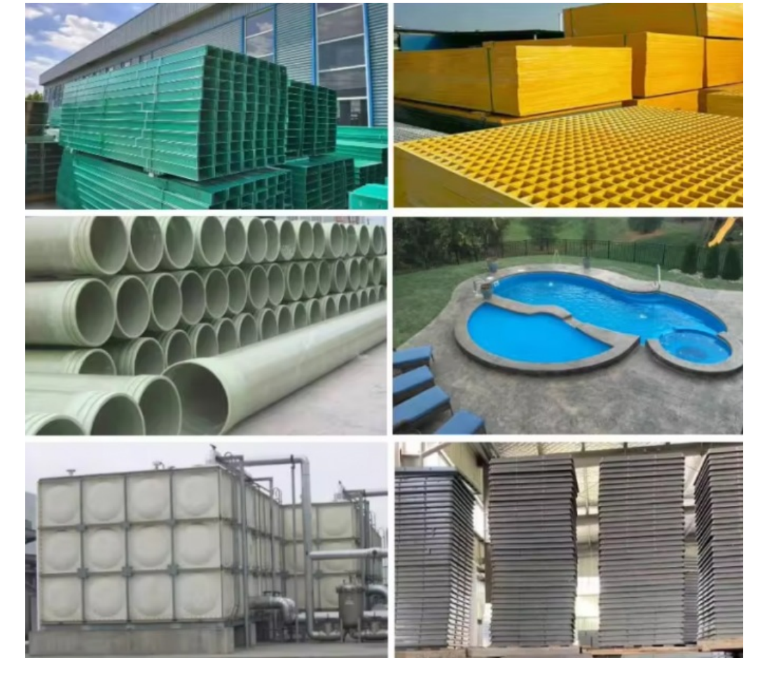
Transportation and packaging