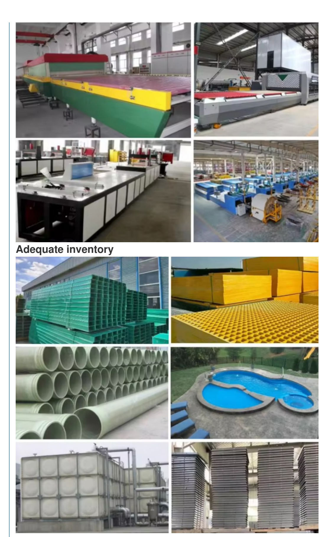
Transportation and packaging