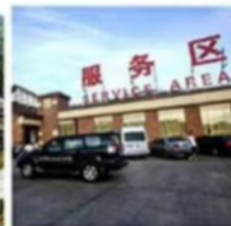
High speed service sewage