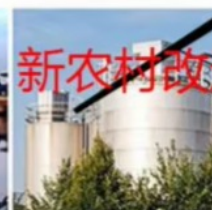
Industrial chemical sewage