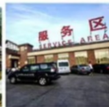
High speed service sewage