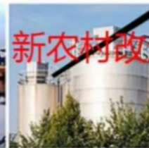
Industrial chemical sewage