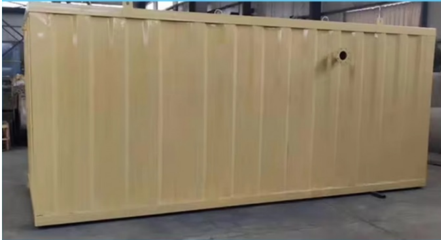
Carbon steel housing plus MBR treatment process