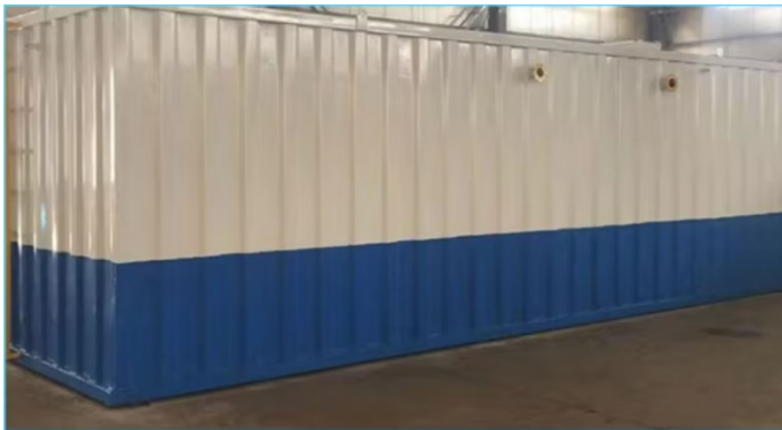
Fiberglass reinforced plastic alone