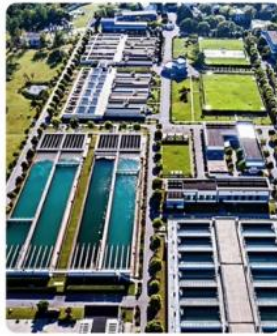
✓ Community pollution discharge