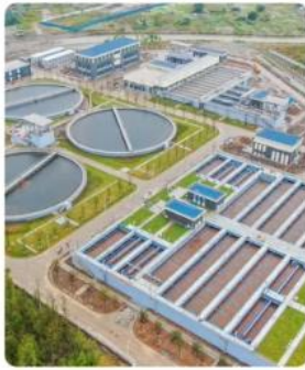
✓ Municipal sewage discharge