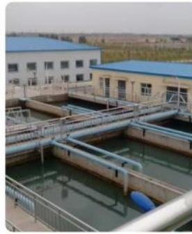
✓ Food factory sewage discharge