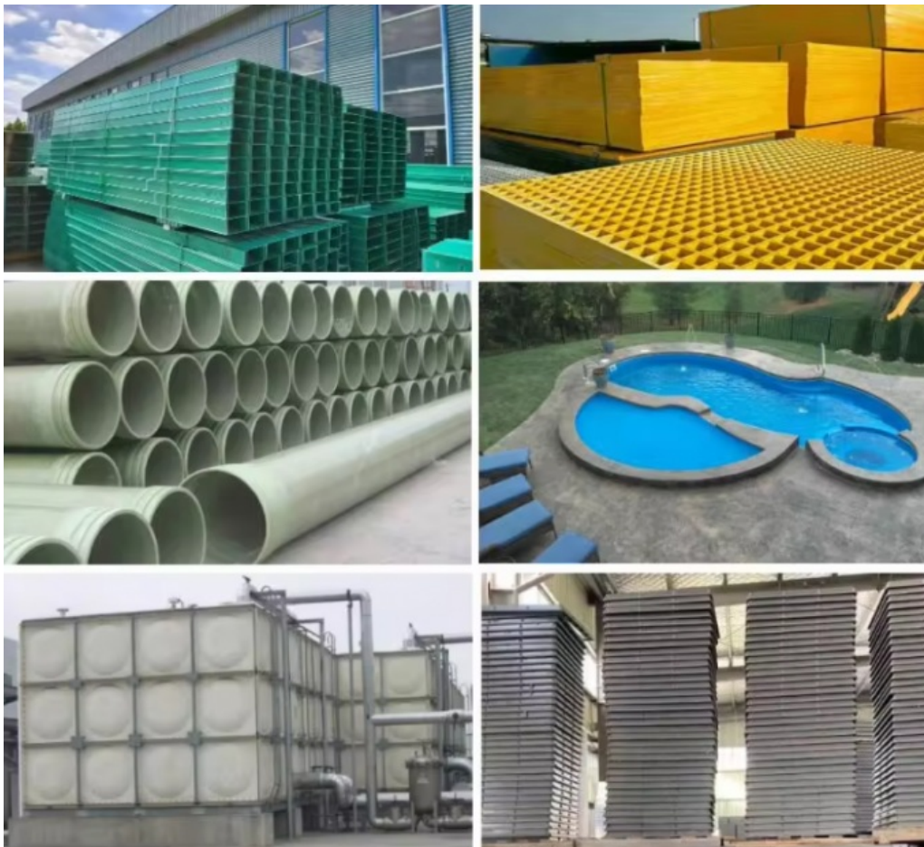
Transportation and packaging