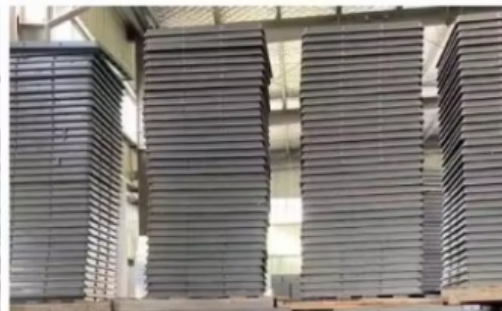
Transportation and packaging