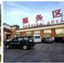
High speed service sewage