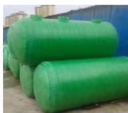
FRP Septic Tank

50 to 200mg among of them. sewage enter into septic tank will remove 50% to 60% suspended matter after 12 to 24h sediment , the sediment sludge will anaerobic digestion above 3 month, which will make the organism decompose stable inorganics, corruptible raw sludge translate to ripe sludge , it changed sludge structure, reduce sludge water ratio, clear it and transport out regular. Landfill or reuse it as fertilizer