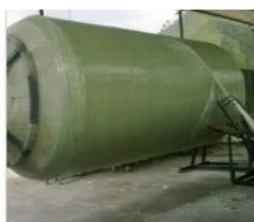
FRP Wrapped Septic Tank