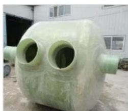
Small FRP Septic Tank