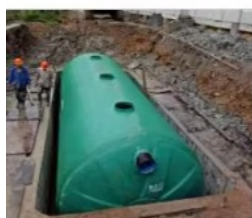
Integrated FRP Septic Tank