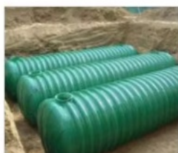
Corrugated FRP Septic Tank