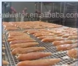
Food processing plant