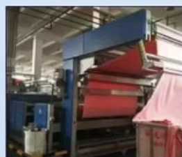
Printing and dyeing industry