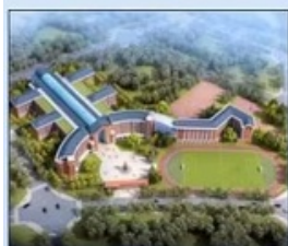
School daily sewage