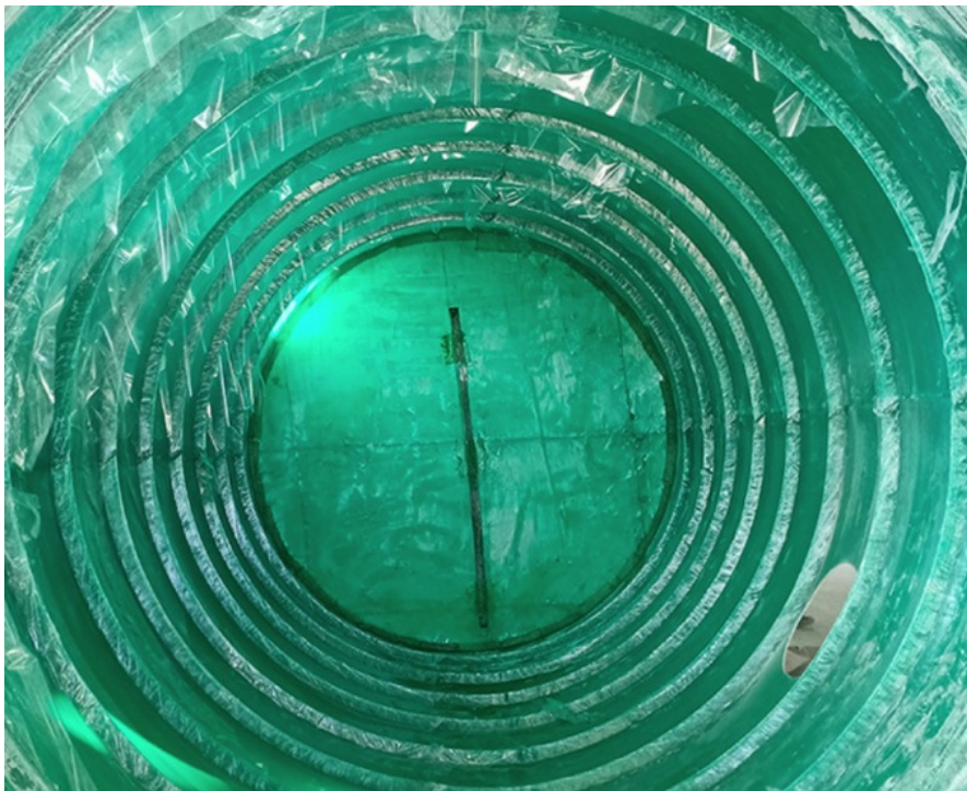
External frame or internal reinforcement